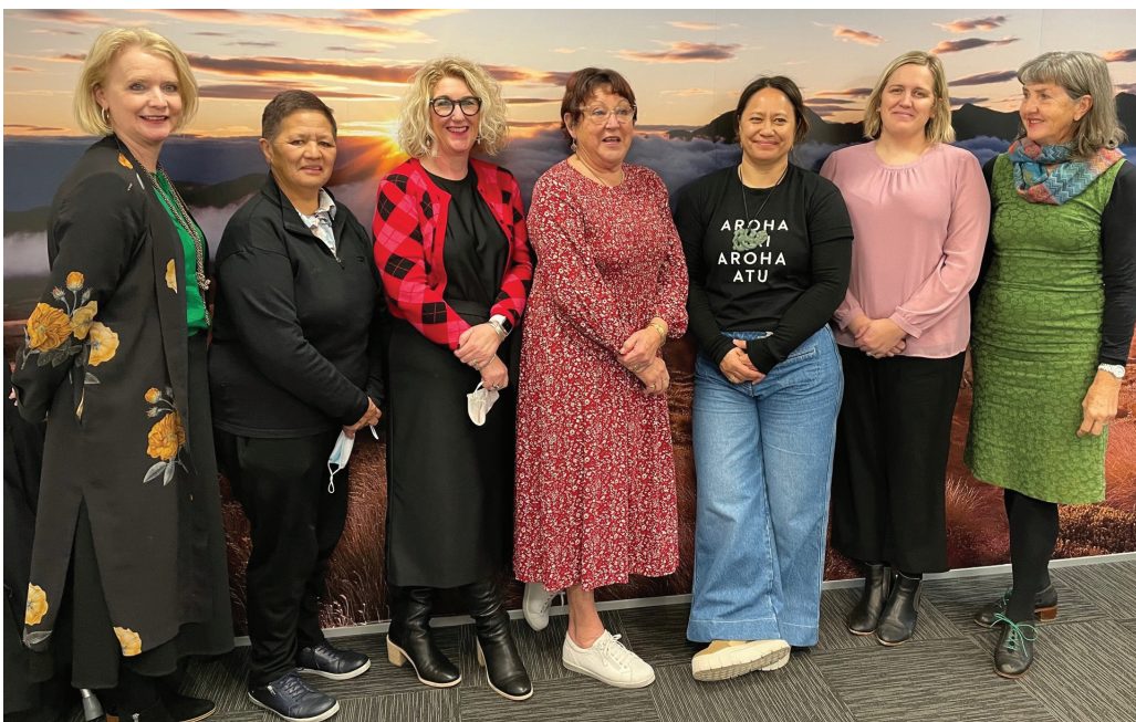
Te Tatau o te Whare Kahu | Midwifery Council Board

This is to make sure you are giving evidence-informed care to keep women and their babies safe as well as meeting all the Competencies for Entry to the Register, specifically Competency Four which states that the midwife upholds professional midwifery standards and uses professional judgment as a reflective and critical practitioner when providing midwifery care.